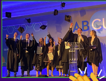
CU Futures Class of 2023 graduating at the ABCUL Conference, March 2023.

I would really encourage any young professional thinking of taking part in CU Futures to just go for it! My knowledge of the CU sector and finance has more than doubled. It's an amazing opportunity and it can be challenging, but it's so worthwhile.